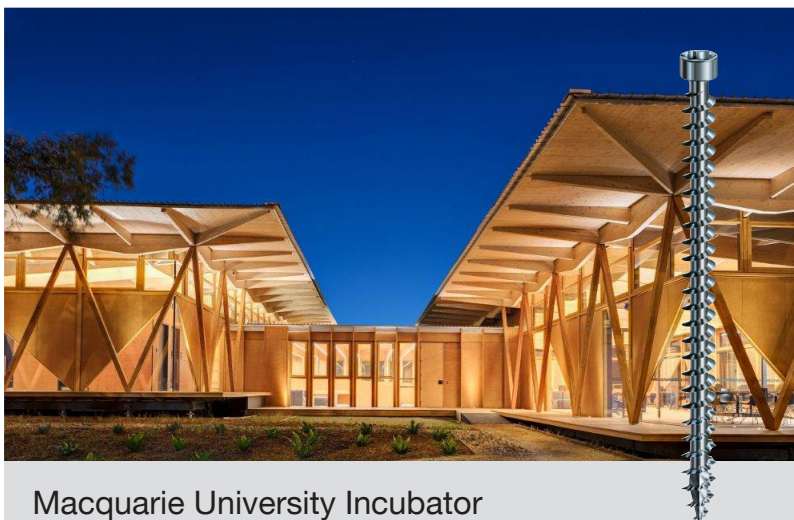
Macquarie University Incubator