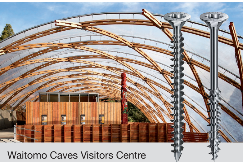
Waitomo Caves Visitors Centre