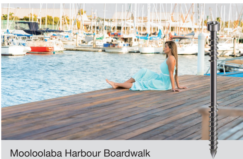
Mooloolaba Harbour Boardwalk