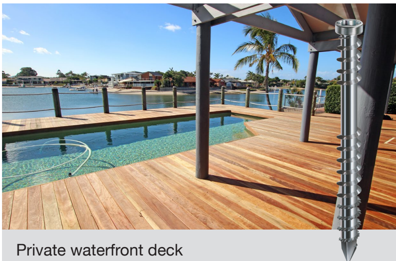
Private waterfront deck