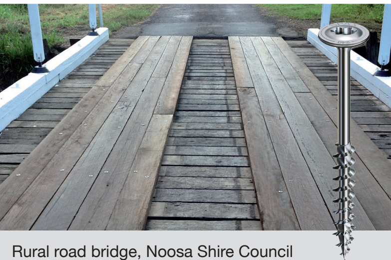
Rural road bridge, Noosa Shire Council